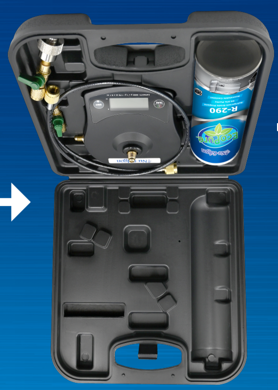
Hard carrying case

Allows storage of an EcoPure canister (sold separately)