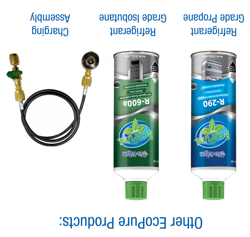
Other EcoPure Products:

Allows storage of an EcoPure canister (sold separately)